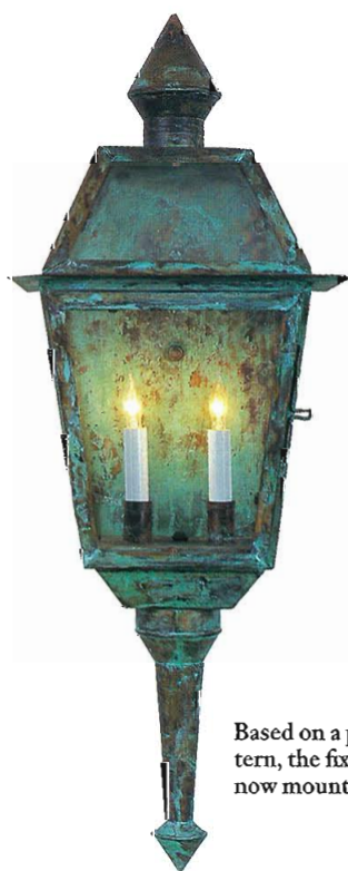
Based on a post lantern, the fixture, left, now mounts to a wall.