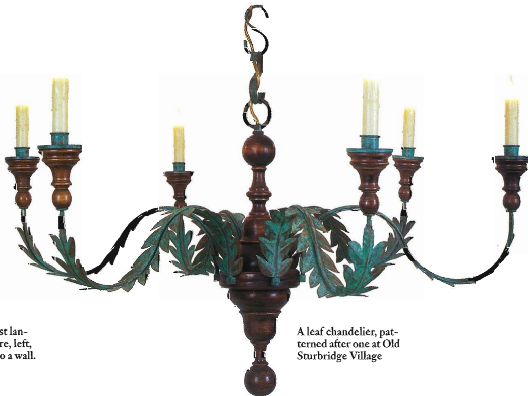
A leaf chandelier, patterned after one at Old Sturbridge Village